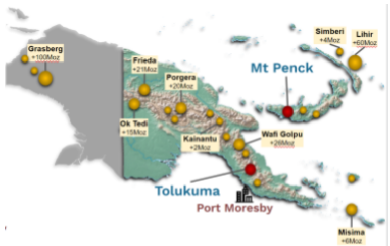
Figure 01: Project Locations in PNG

Mineralisation has been classified as high sulphidation epithermal gold with indications of underlying porphyries 3 . These results are taken from historical reports by a former owner of the project which may be not in accordance with JORC or other international standards. Tempest and consultants are reviewing the data however, nothing at this time causes the acquirer to question the reliability of the former owner's results.